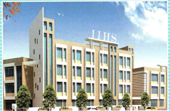
INDRAPURAM INSTITUTE OF HIGHER STUDIES Indrapuram, Ghaziabad website : www.theiihs.com