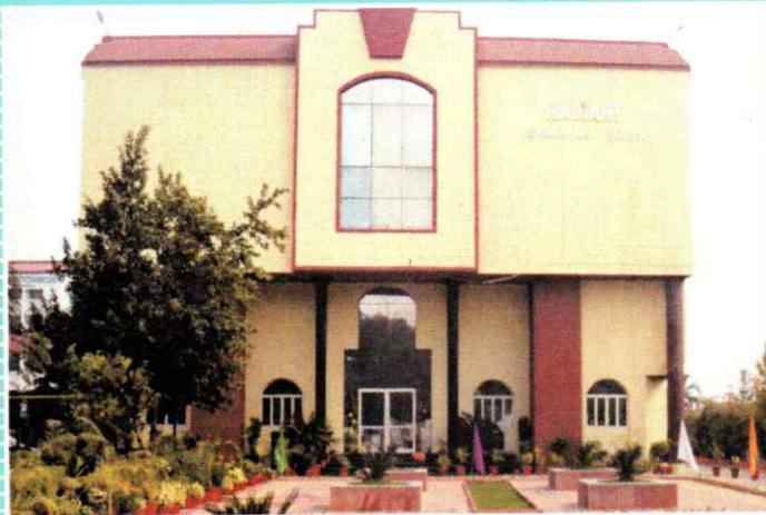
RADIANT INTERNATIONAL SCHOOL Khagaul, Danapur, Patna website : www.radiantpatna.com