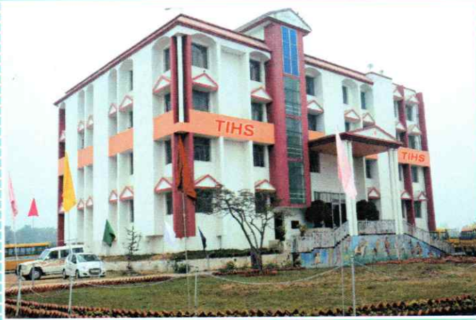
TAPINDU INSTITUTE OF HIGHER STUDIES Saguna More, Cantt. Road, Khagaul, Patna-5 website : www.tihspatna.com